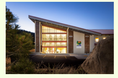
Mammoth Lakes Location 1290 Tavern Road Suite 246

Call to make an appointment at your preferred Mono County location 760-924-1830