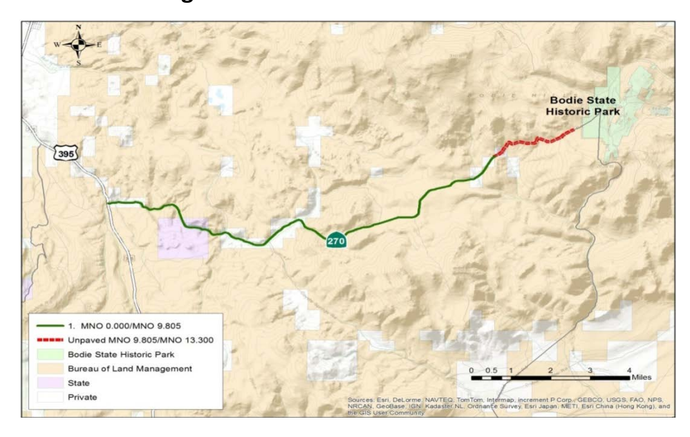
Segment 1: PM 0.000 - PM 9.805

This segment begins at US 395 (PM 0.000) and ends 9.805 miles east of US 395 (PM 9.805). The route lies in a rural area of northeastern Mono County and the majority of the surrounding land is publicly owned. It is a two-lane conventional highway traversing winding, mountainous terrain. SR 270 is classified as a Major Collector with a posted speed limit of 55 mph. It is undivided and does not have access control. Services such as food, lodging, and gasoline, are not available along SR 270 or in Bodie.