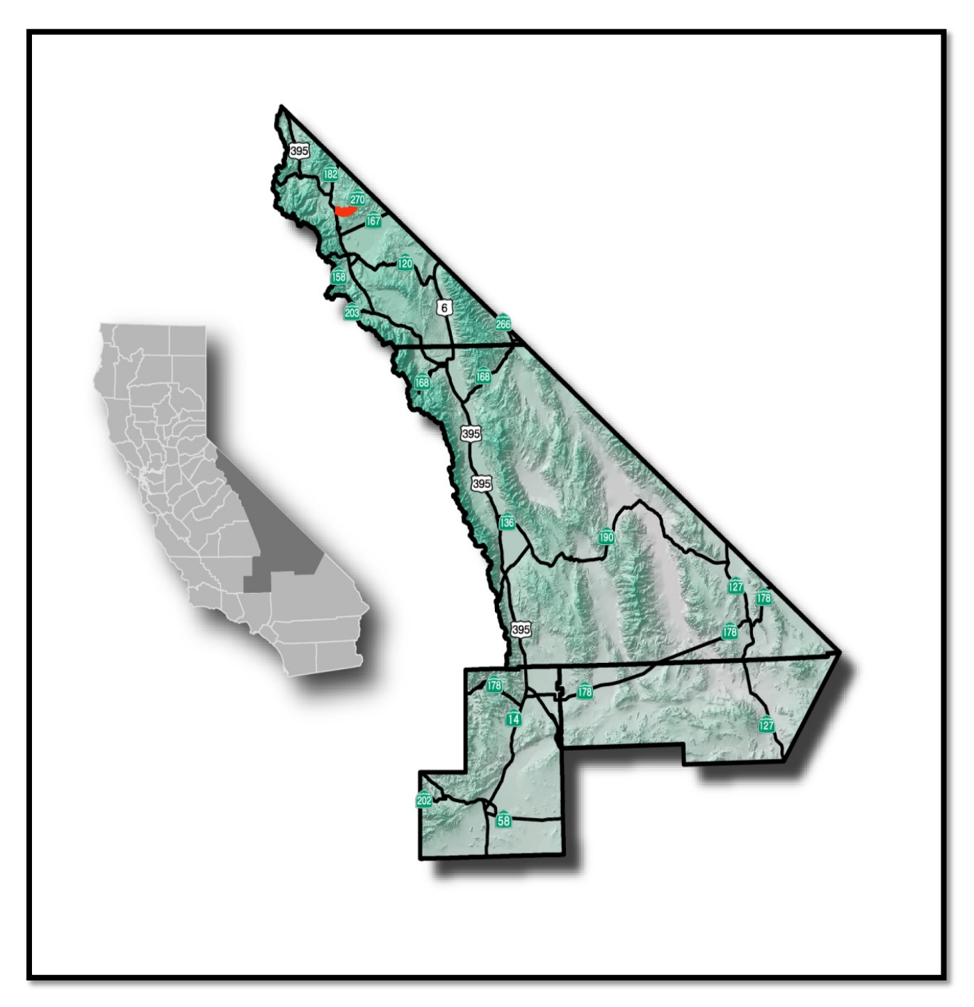
SR 270 Location Map Caltrans District 9, Mono County