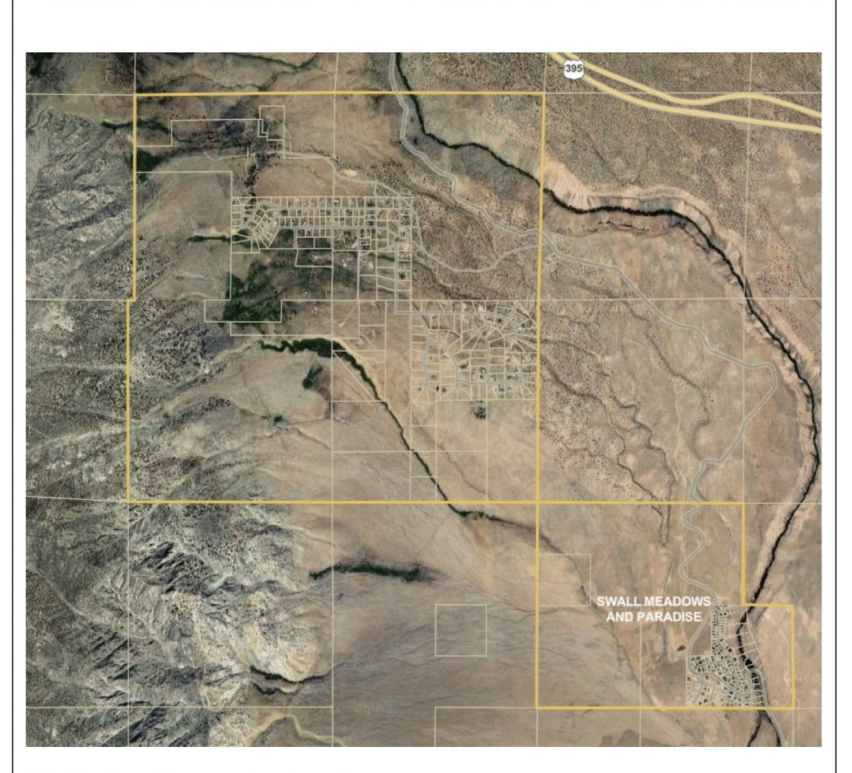
Wheeler Crest Planning Area boundaries

Recent development has largely been reconstruction following the 2015 Round Fire - six homes have been rebuilt since the fire, with more underway. The Rock Creek Ranch Specific Plan, located east of Paradise, provides an opportunity for a singlefamily residential subdivision. However, water service and access remain barriers for the potential project.