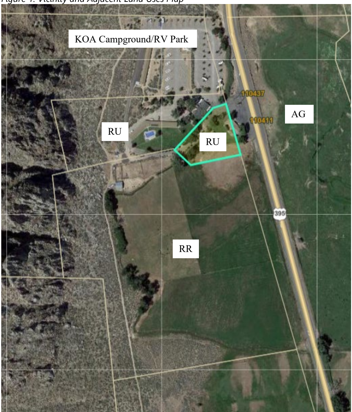
Figure 1. Vicinity and Adjacent Land Uses Map

Previously, the RV park/campground, Meadowcliff Lodge, and restaurant had been under single ownership, and then the parcels were sold separately with Meadowcliff Lodge and the RV park under one owner and the restaurant under other owners. The restaurant property does not contain a residential unit, and so the owners were living in an RV.