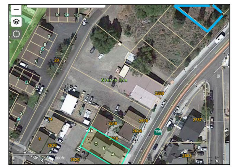
Figure 1 - Subject property outlined in green; proposed off-site snow storage outlined in blue.

INTERESTED PERSONS are strongly encouraged to attend the livecast meeting online (technology permitting) or to attend in-person; and to submit comments by 8 am on Thursday, March 16, 2023, to the Planning Commission Secretary, PO Box 347, Mammoth Lakes, CA 93546 or by email at cddcomments@mono.ca.gov. If you challenge the proposed action(s) in court, you may be limited to raising only those issues you or someone else raised at the public hearing described in this notice, or in written correspondence delivered to the Secretary of the Planning Commission at, or prior to, the public hearing.