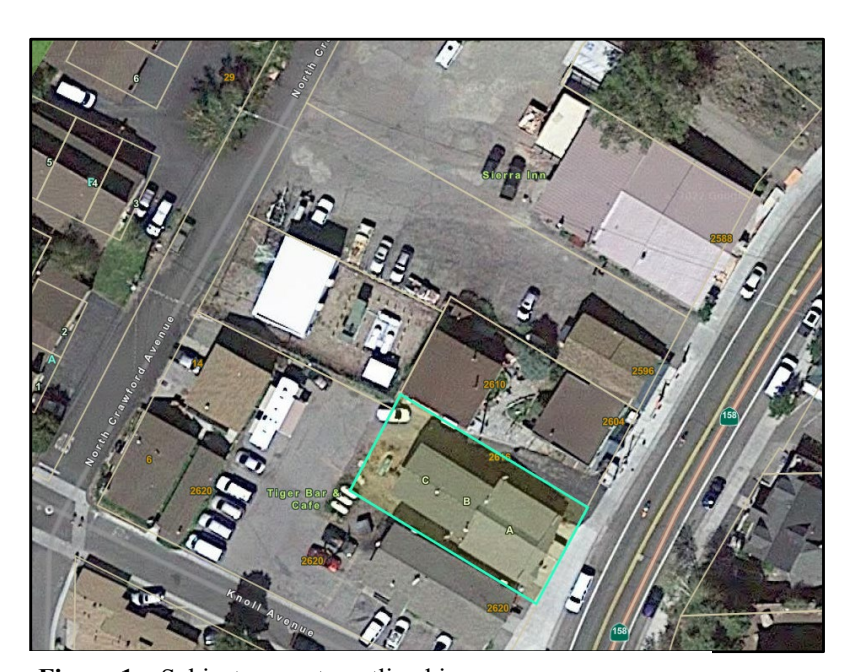
Figure 1 – Subject property outlined in green.

The proposal is for a parking reduction plan on a 0.11-acre parcel located in the June Lake Central Business District at 2616 State Route (SR) 158, (APN 015-075-005-000), and for off-site snow storage on a nearby parcel (APN 015-075-117-000). Both parcels are designated Commercial (C). The surrounding parcels are all designated Commercial. On the applicant's property, the portion of the building fronting SR 158 contains the retail business, Sierra Wave. Two long-term rental residences are located in the rear portion of the building and are situated adjacent to the neighboring L-shaped parcel