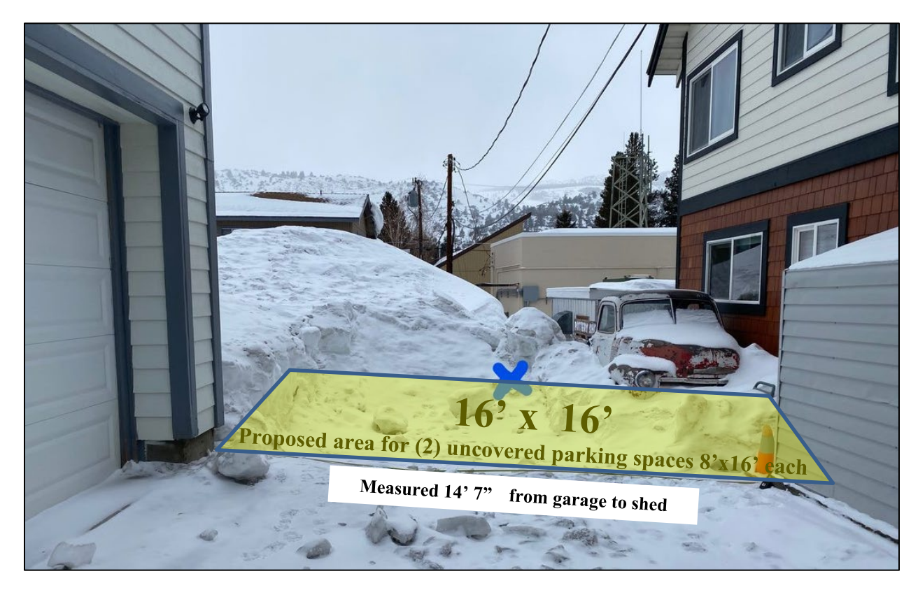
Figure 5 – Proposed uncovered parking area

Once the snow, shed, and old vehicle are removed, adequate space should exist to maintain and utilize the two parking places previously established under DR 01-12. Year-round access to the two uncovered parking spaces onsite would be required to establish the minimum amount of onsite parking required under MCGP LUE §6.090.