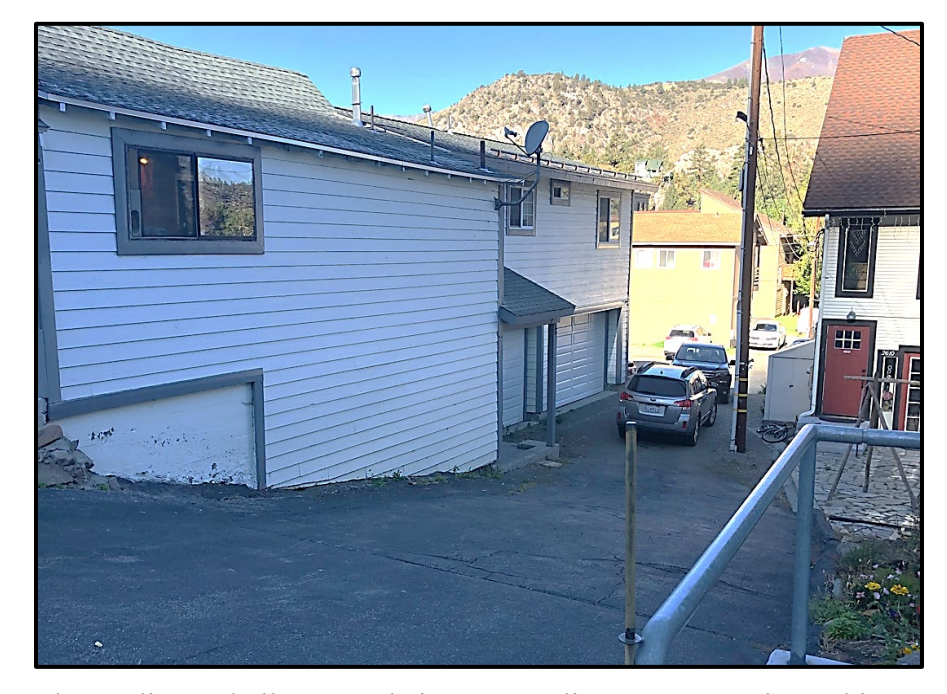
Figure 3 (above) – Subject property and neighboring properties. Proposed uncovered parking spaces lined in yellow.