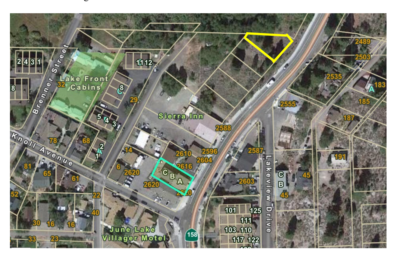
Figure 2 – Subject property outlined in green; proposed off-site snow storage parcel outlined in yellow.

The property has an existing, non-conforming snow storage area and the proposed use would further reduce the snow storage area because the two outdoor parking spots are currently being used for snow storage.