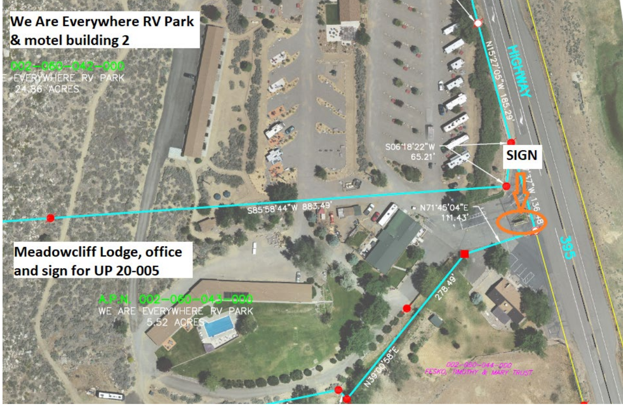
Figure 2: Meadowcliff Lodge and We Are Everywhere RV Park Site Plan

Conditional use permit (CUP) 31-97-03 was approved in August 1997 and memorialized the signs at the time as existing nonconforming, requiring that "...any future signs shall meet the requirements of Mono County Zoning and Development Code 19.35 'Signs." The signage at that time included a combination of large sign faces as part of a single freestanding sign on the RU motel and office parcel (-043), as well as a separate sign on another parcel to the south which was permitted under a CUP modification in 2007 and is not affected by this proposal. For the RU parcel (-043), one freestanding sign included approximately 172 square feet (sf) of signage, including a monument sign, marquee sign, neon 'Restaurant', neon 'No Vacancy,' and 'Propane tank fill' sign (see Figure 3).