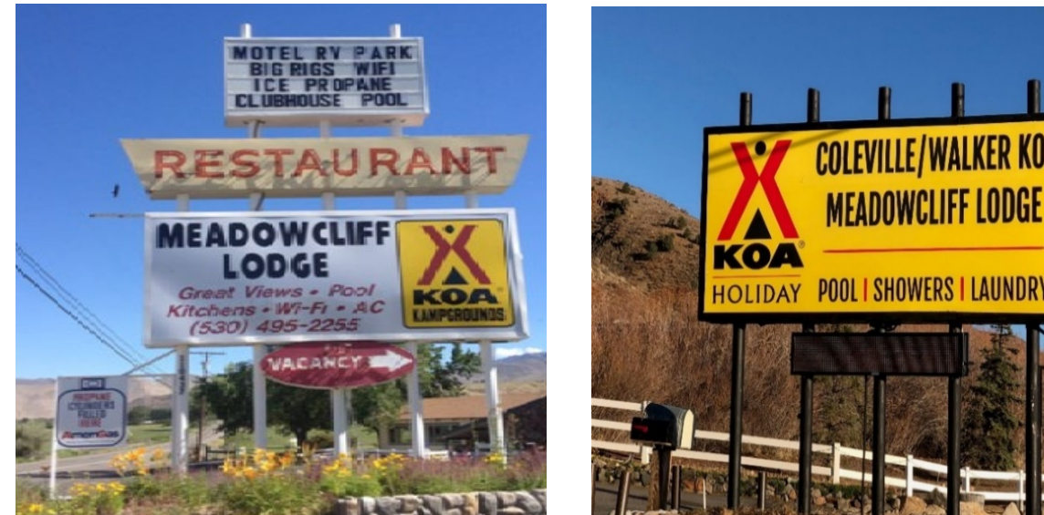
Figure 3: Previous signage under UP 31-97-03