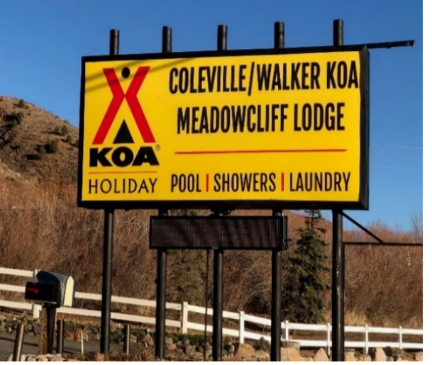
Figure 4: Signage at the time of Notice of Violation November 2019

The applicant then applied for a Director Review (DR) Permit in February 2019 to permit the LED sign on the freestanding sign per General Plan Land Use Element Chapter 7, section 7.030.C. The DR permit was denied because the LED sign increases lighting intensity of the past nonconforming use and therefore violates General Plan Land Use Section 07.070.A. Expansion: A nonconforming sign may not be increased in area or lighting intensity...and Section 07.040.B. Sign Illumination: For those signs to be lit, indirect illumination from a separate light source is required, with the exception of channel letters. Use of neon and internal lighting is prohibited unless integrated with an overall architectural or design theme and is subject to Director's approval. An indirectly illuminated sign is defined as any sign whose illumination is reflected from its source by the sign display surface to the viewer's eve, the source of light not being visible from the street or from abutting property.