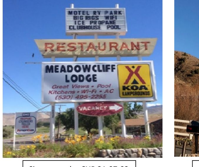
Signage under CUP 31-97-03

In 2019, a new property owner replaced the nonconforming signs and a complaint was received. The current signage includes an approximately 55 sf free-standing internally lit monument sign and a light emitting diode (LED) safety/required sign. A Notice of Violation (NOV) was sent on November 22, 2019 (Attachment 2), to the applicant regarding the new LED sign installation. At the time of inspection, the LED sign had two violations, including replacement of the non-conforming neon Vacancy sign with a prohibited internally lit sign that intensified lighting and had an animated, scrolling typeface of "Closed, Open March...". The animation was subsequently removed from the sign.