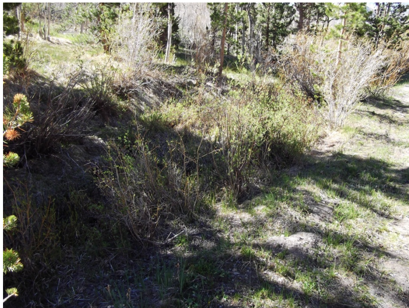
Figure 2: Wetland 48