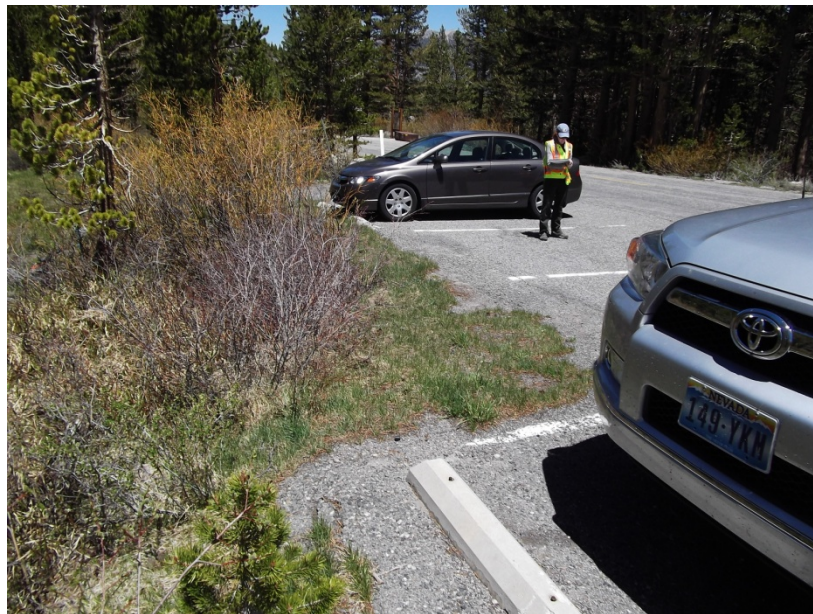
Figure 1: Wetland NRPW-5

After further discussion, it was identified that there are an adequate number of longer parking spaces to accommodate larger vehicles within the existing extents of the parking lot. If necessary, “Compact Car Parking Only” signs may be placed at the shorter stalls to discourage larger vehicles from parking in these spaces. By repaving the parking lot only within its existing footprint, impacts to NRPW-5 will be avoided.