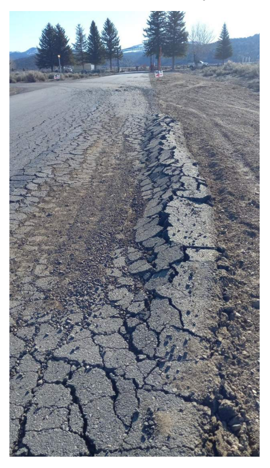
Aurora Canyon Road (North Buckeye to Cemetery Rd) - Bridgeport

Planning / Building / Economic Development / Code Compliance / Environmental / Collaborative Planning Team (CPT) Local Agency Formation Commission (LAFCO) / Local Transportation Commission (LTC) / Regional Planning Advisory Committees (RPACs)