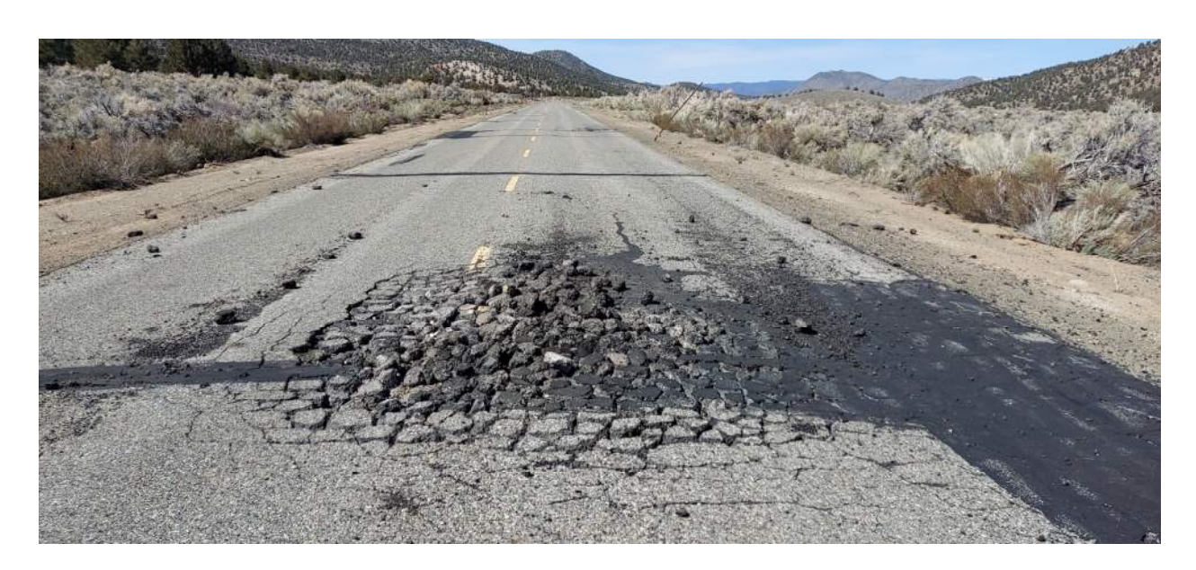
Benton Crossing Road – 3.7 miles southwest of Highway 120