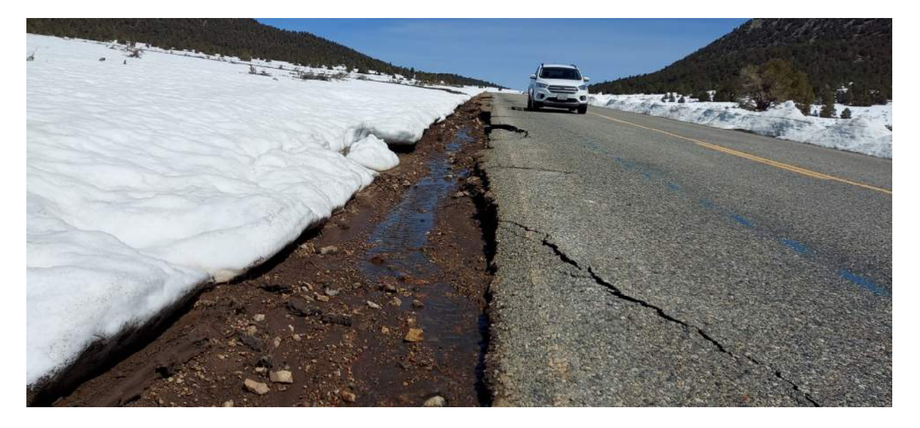
Benton Crossing Road – 7.9 miles from Highway 120