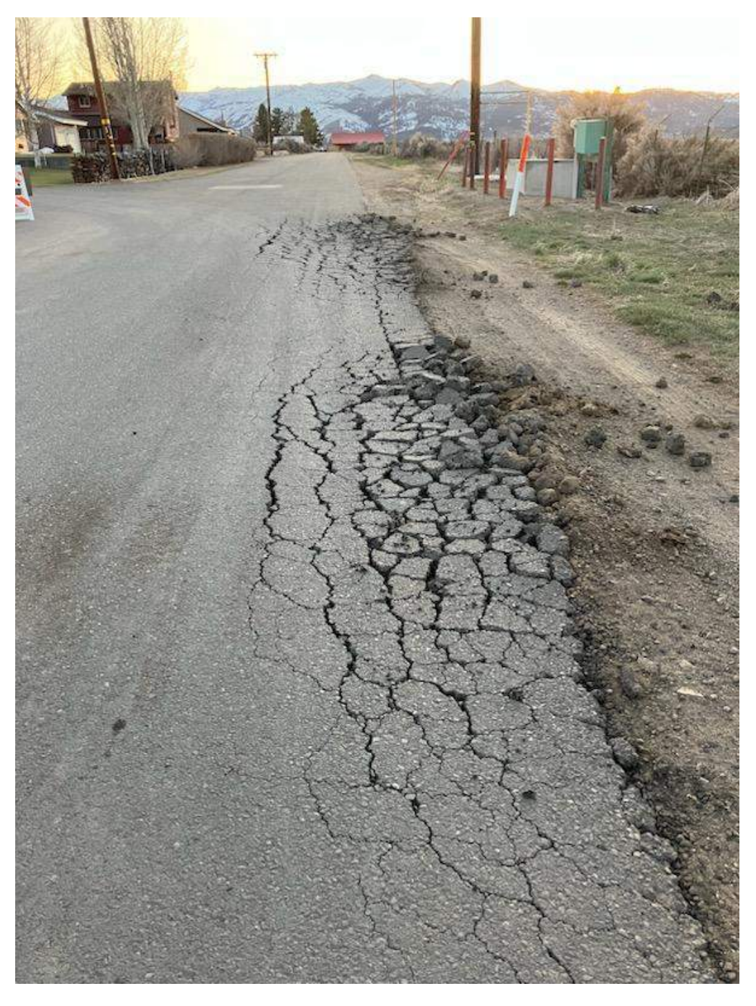
Stock Drive (at Sinclair intersection) - Bridgeport