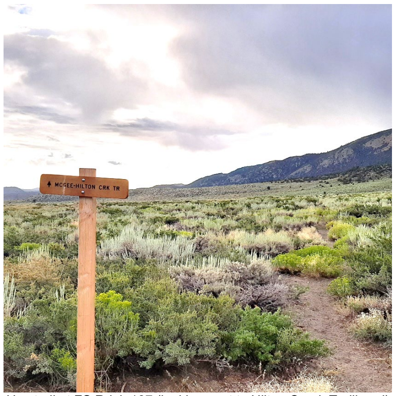
Use trail at FS Rd 4s137 (looking east to Hilton Creek Trailhead)

Submitted by Mono County Sustainable Outdoors and Recreation (MCSOAR) and Mono County to United States Department of Agriculture, Forest Service, White Mountain Ranger District United States Department of Interior, Bureau of Land Management, Bishop Field Office