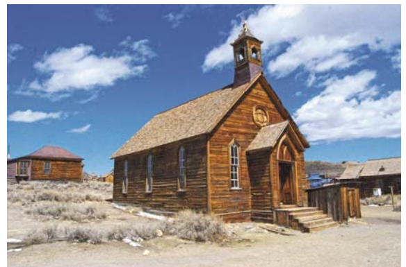
Alekos McKee/Mono County Tourism/ Bodie

Mono County has several small towns and charming villages, each with their own scenic beauty, year-round recreational opportunities, natural and historical attractions, and unique characteristics. The County seat is proudly located in Bridgeport where the original courthouse is the second oldest in the state to be in continuous use. The only incorporated town in the county is Mammoth Lakes, which is located at the base of world-renowned Mammoth Mountain Ski Area, with a summit of 11,053 feet, over 3500 skiable acres, 28 lifts, and an average of 400 inches of snowfall annually. Approximately 7,500 people reside in the Mammoth Lakes area year-round, but during the peak winter season, the population swells to over 35,000 when