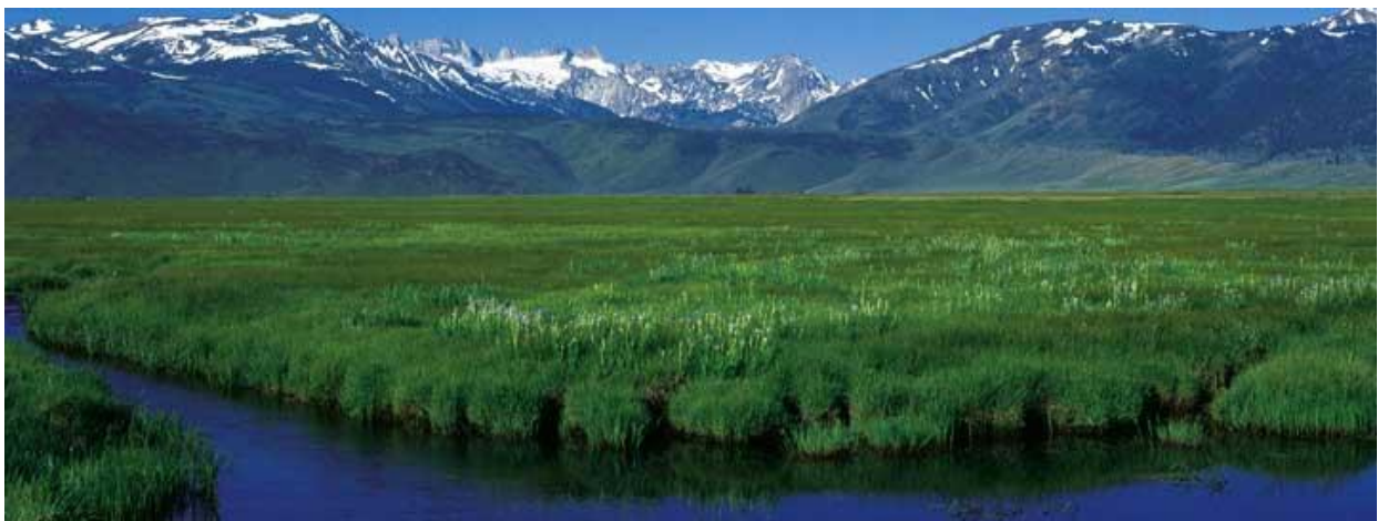
Greg Newbry/ Bridgeport Valley