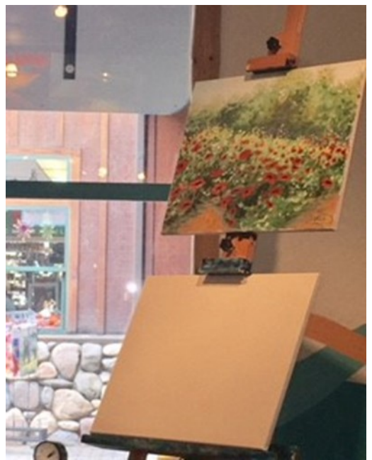
This was original painting we were copying from.

have a strong team that is very cohesive and complimentary to one another. We plan to try to do this once each year. It's a nice way to connect with one another!