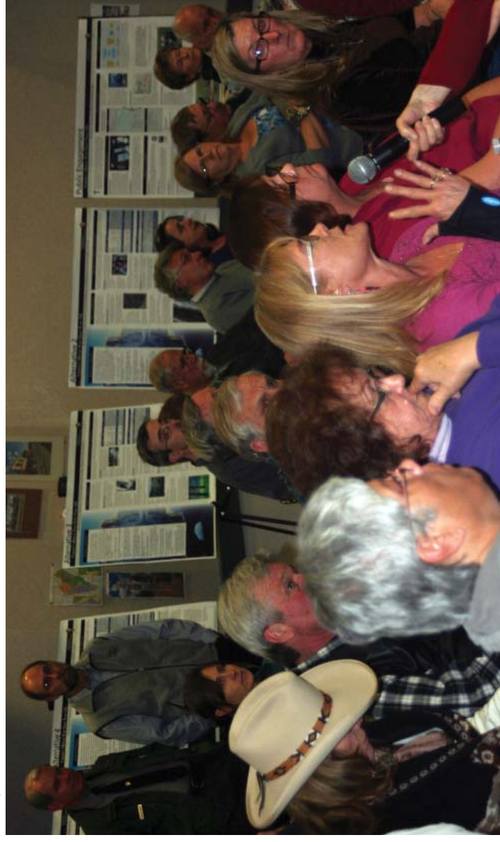
Public comment informed every step in the planning process. The NPS hosted 54 public meetings and 12 webinars during the development of the plan.

The Final Merced River Plan/EIS will be the guiding document for protecting and enhancing river values and managing use and user capacity within the Merced River corridor for the next 20 years. As such, it evaluates impacts and threats to river values and identifies strategies for protecting and enhancing these values over the long-term. The plan follows and documents planning processes required by the National Environmental Policy Act (NEPA), the National Historic Preservation Act (NHPA), and other legal mandates governing National Park Service decision-making. In accordance with these statutes, it was developed in consultation with members of the public, traditionally associated American Indian tribes and groups, and other key stakeholder groups. The Final Merced River Plan/EIS reflects a number of changes—discussed in following sections of this document—that were made in response to comments on the Draft Environmental Impact Statement.