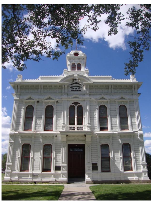
Mono County Courthouse Bridgeport, CA