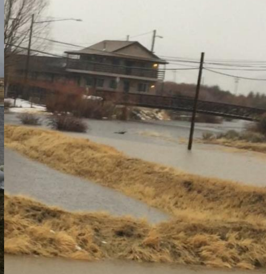
Bridgeport flooding, January 2017