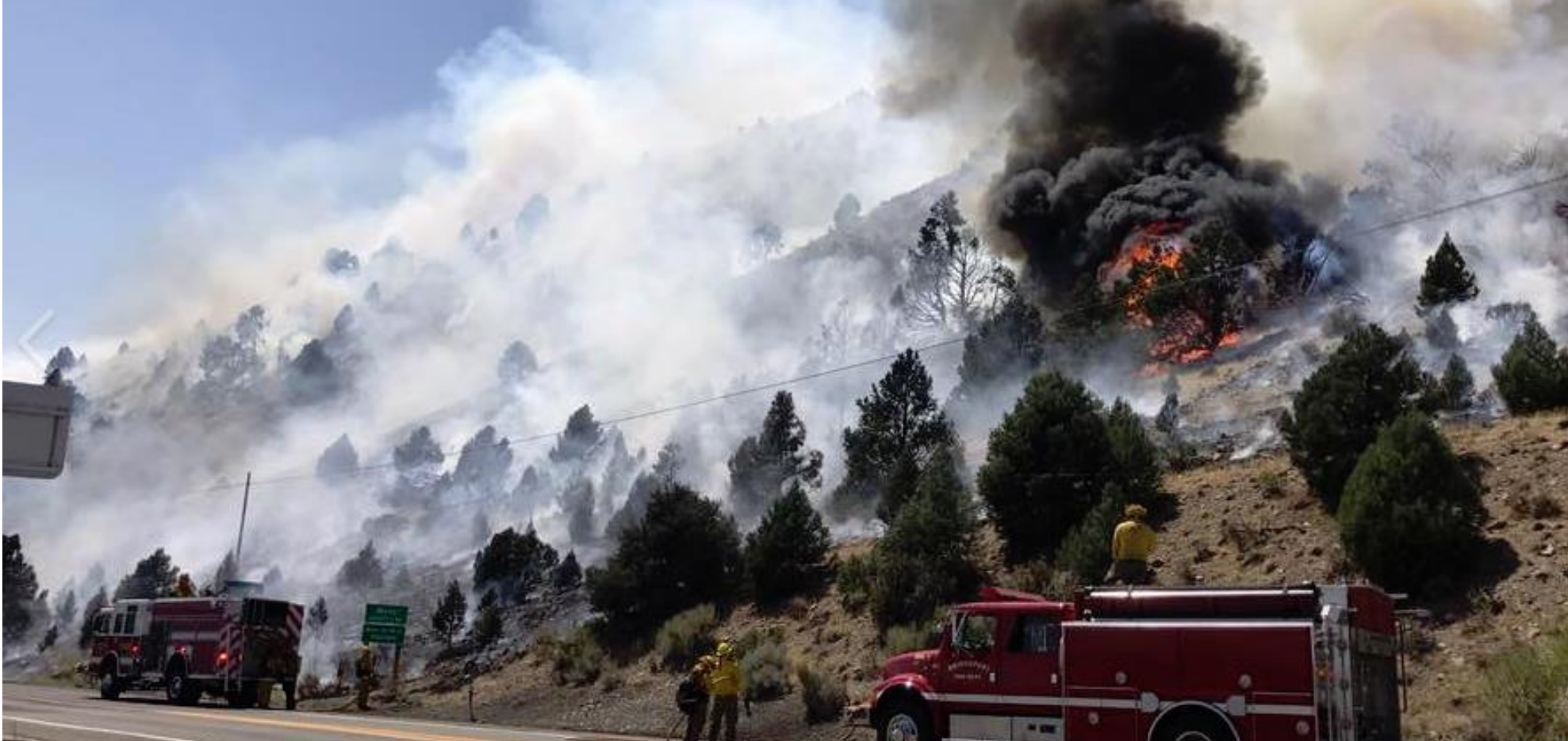
Slinkard Fire August 2017