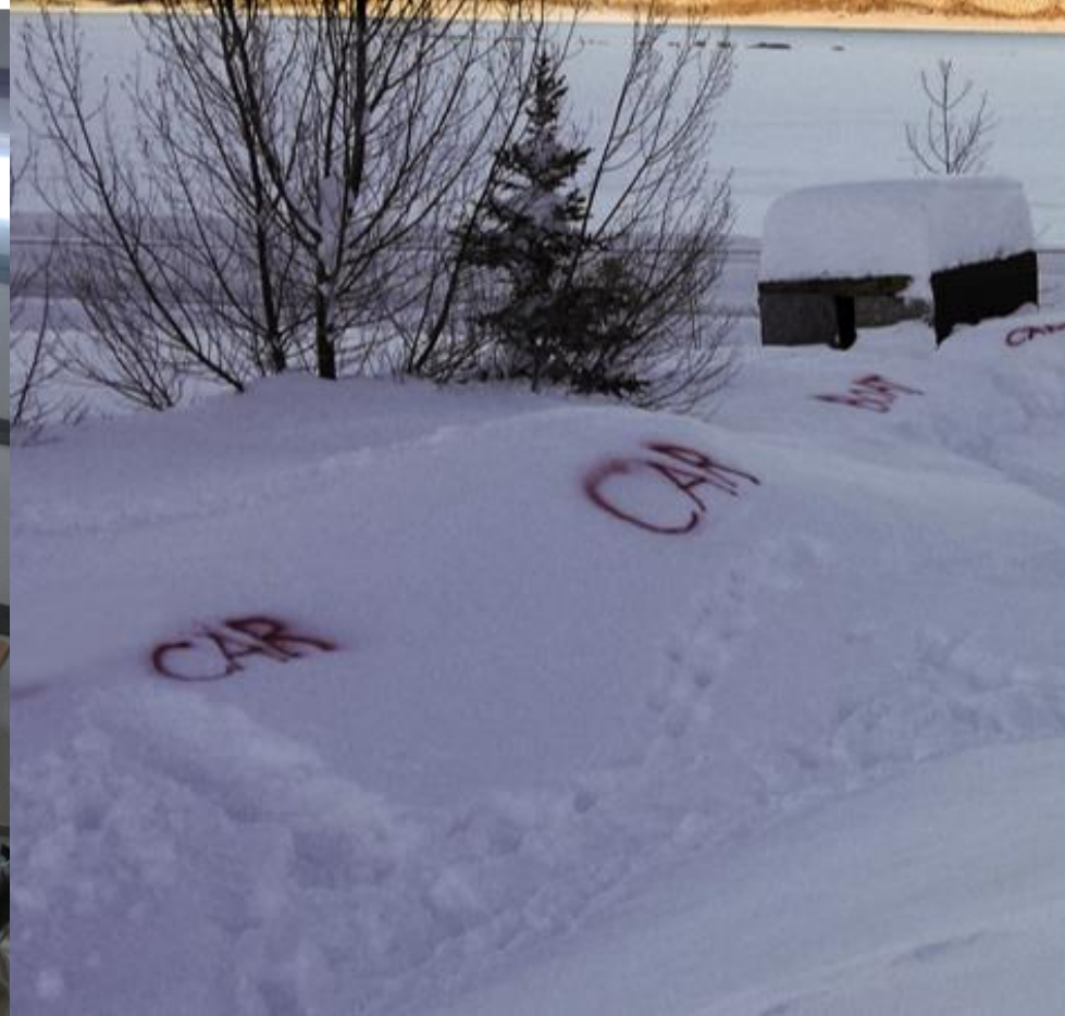
Mammoth Snow Load and Long Valley Avalanche, January 2017