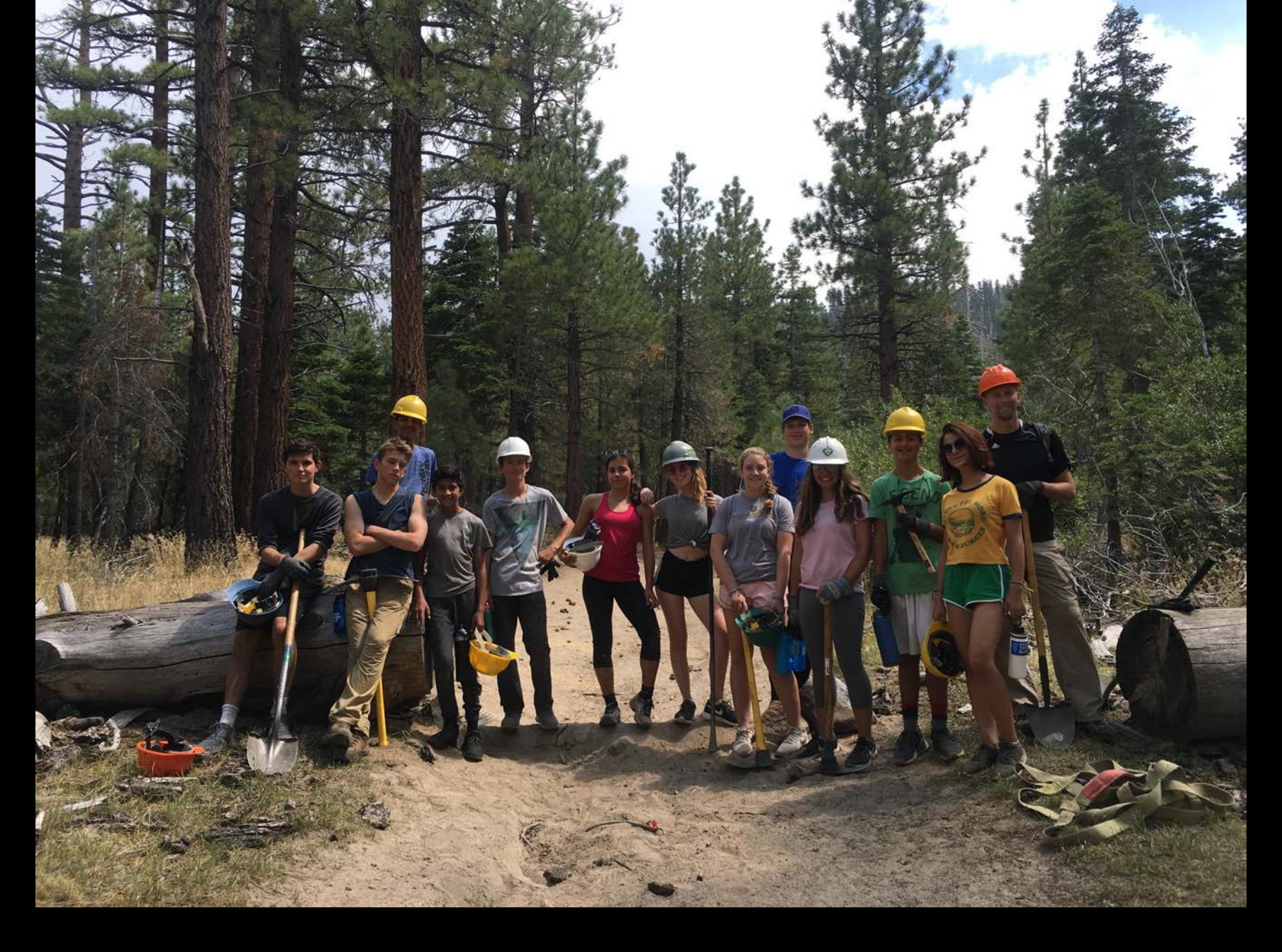
Summer 2018: 6 youth groups ◆ 8 days of service in Mono County