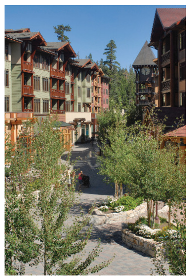
Mammoth Mountain Ski Area

Mono County has several small towns and charming villages, each with its own scenic beauty, year-round recreational opportunities, natural and historical attractions, and unique characteristics. The County seat is proudly located in Bridgeport, where the original 1881 courthouse is the second oldest in the state to be in continuous use. The only incorporated town in the county is Mammoth Lakes, which is located at the base of world-renowned Mammoth Mountain Ski Area, with a summit of 11,053 feet, over 3500 skiable acres, 28 lifts, and an average of 400 inches of snowfall annually. January 2017 recorded historic amounts of snow, with 20.5 feet accumulating in Mammoth during that month alone. Approximately 7,500 people reside in the Mammoth Lakes area year-round, but during the peak winter season, the population swells to over 35,000 when visitors from around the state, country, and world come to ski, snowboard, and take part