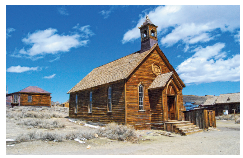
Bodie

of the world's finest examples of columnar basalt, and the headwaters of the Owens and Middle Fork San Joaquin Rivers, two of the state's most important watersheds. Yosemite National Park's eastern entrance at Tioga Pass is only 12 miles from Lee Vining and Mono Lake.