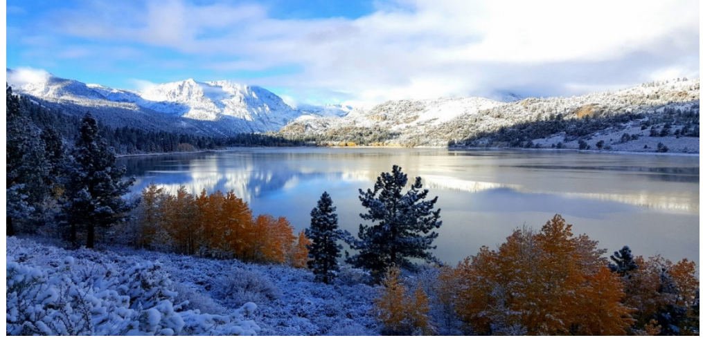
Alicia Vennos/Mono County

Summer, however, is when Mono County really shines. The region offers countless miles of alpine hiking, superb trout fishing at dozens of well-stocked lakes, streams and rivers, kayaking, cycling, horseback riding, golfing, and endless warm-weather adventures. Photographers flock to the county in September and October when it is almost impossible to take a bad photo of the fall color that lights up the Eastern Sierra landscape. Sunset Magazine named Mono County one of the "Top 5 places to Hike" in autumn and TravelAndLeisure.com listed Mono County as one of "America's Best Fall Color Drives." A wide variety of lodging, restaurants, and shops are available throughout the county, and commercial air service to Mammoth Yosemite Airport, just a 10-minute drive from the Town of Mammoth Lakes, is accessible from Los Angeles, San Francisco, and San Diego on Alaska and United Airlines throughout the winter, and from Los Angeles in summer and fall.