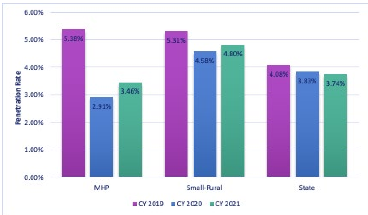
Latino/Hispanic Penetration Rates CY 2018-20