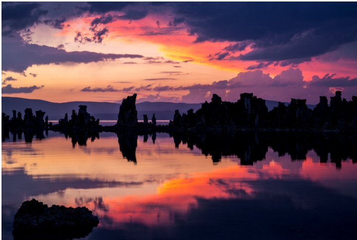
Mono Lake

Mono County, California, is a rural county situated between the crest of the Sierra Nevada and the California/Nevada border. Accessed by state-designated Scenic Byway US Highway 395 which weaves its way north-south, Mono County is 108 miles in length, and has an average width of only 38 miles. With dramatic mountain boundaries that rise in elevation to over 13,000 feet, the county's diverse landscape includes forests of Jeffrey and Lodgepole pine, juniper and aspen groves, hundreds of lakes, alpine meadows, streams and rivers, and sage-covered high desert. The county has a land area of 3,030 square miles, or just over 2 million acres, 94% of which is publicly owned. Much of the land is contained in the Inyo and Humboldt-Toiyabe National Forests, as well as the John Muir and Ansel Adams Wilderness areas. As a result, Mono County offers vast scenic and recreational resources, and has unsurpassed access to wilderness and outdoor recreation and adventure.