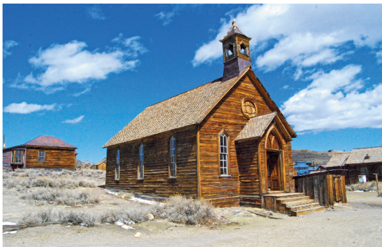
Alekos McKee/Mono County Tourism/ Bodie

maintained as a State Historic Park with about 200 buildings still standing as they were left, preserved in "arrested decay" for visitors to enjoy. Other natural wonders that attract people to Mono County include Devils Postpile National Monument, one of the world's finest examples of columnar basalt, and the headwaters of the Owens and Middle Fork San Joaquin Rivers, two of the state's most important watersheds. Yosemite National Park's eastern entrance at Tioga Pass is only 12 miles from Lee Vining and Mono Lake.