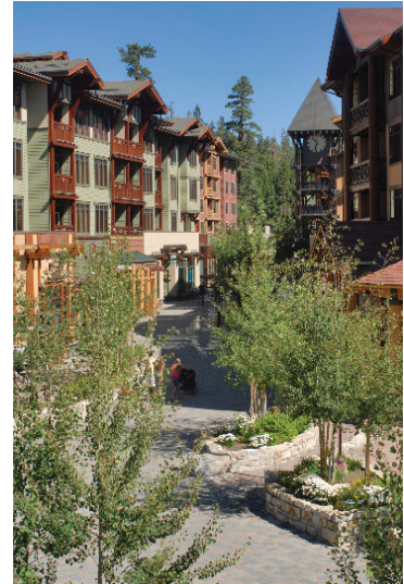
Mammoth Mountain Ski Area

Mono County has several small towns and charming villages, each with its own scenic beauty, year-round recreational opportunities, natural and historical attractions, and unique characteristics. The County seat is proudly located in Bridgeport, where the original 1881 courthouse is the second oldest in the state to be in continuous use. The only incorporated town in the county is Mammoth Lakes, which is located at the base of world-renowned Mammoth Mountain Ski Area, with a summit of 11,053 feet, over 3500 skiable acres, 28 lifts, and an average of 400 inches of snowfall annually. January 2017 recorded historic amounts of snow, with 20.5 feet accumulating in Mammoth during that month alone. Approximately 7,500 people reside in the Mammoth Lakes area year-round, but during the peak winter season, the population swells to over 35,000 when visitors from around the state, country, and world come to ski, snowboard, and take part in many other winter activities. The sister resort, June Mountain, just 20 miles north of Mammoth, offers uncrowded, wide-open slopes and a more peaceful, family-friendly alternative to busier ski areas.