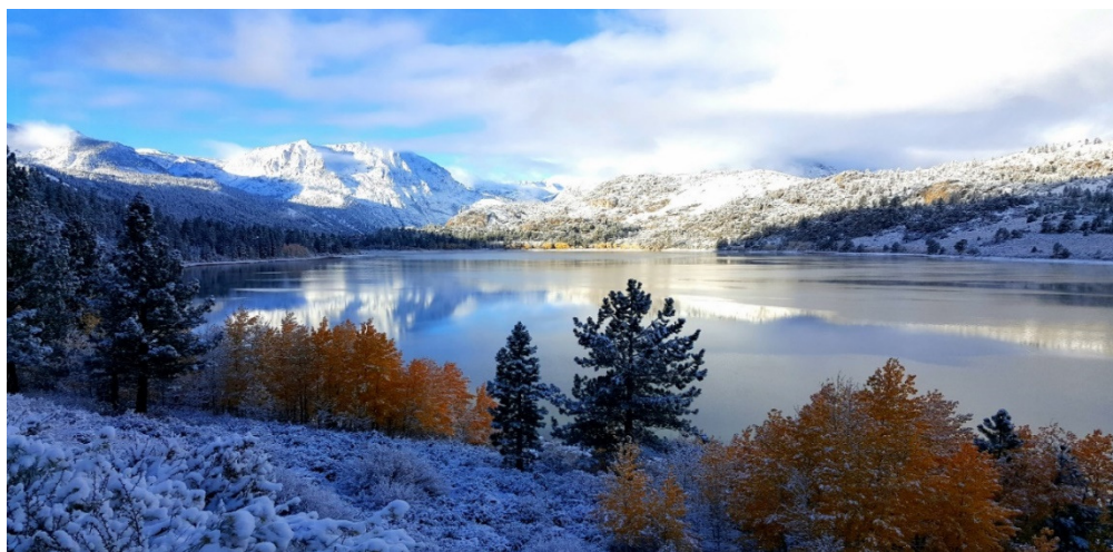
Alicia Vennos/Mono County

Summer, however, is when Mono County really shines. The region offers countless miles of alpine hiking, superb trout fishing at dozens of well-stocked lakes, streams and rivers, kayaking, cycling, horseback riding, golfing, and endless warm-weather adventures. Photographers flock to the county in September and October when it is almost impossible to take a bad photo of the fall color that lights up the Eastern Sierra landscape. Sunset Magazine named Mono County one of the “Top 5 places to Hike” in autumn and TravelAndLeisure.com listed Mono County as one of “America’s Best Fall Color Drives.” A wide variety of lodging, restaurants, and shops are available throughout the county, and commercial air service to Mammoth Yosemite Airport, just a 10-minute drive from the Town of Mammoth Lakes, is accessible from Los Angeles, San Francisco, and San Diego on Alaska and United Airlines throughout the winter, and from Los Angeles in summer and fall.