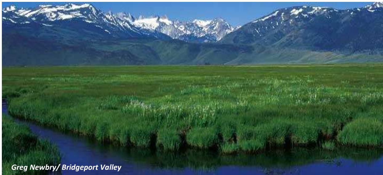
Greg Newbry/ Bridgeport Valley

Summer, however, is when Mono County really shines. The region offers countless miles of alpine hiking, superb trout fishing at dozens of well-stocked lakes, streams and rivers, kayaking, cycling, horseback riding, golfing, and endless warm-weather adventures. Photographers flock to the county in September and October when it is almost impossible to take a bad photo of the fall color that lights up the Eastern Sierra landscape. Sunset Magazine Mammoth Mountain Ski Area named Mono County one of the “Top 5 places to Hike” in autumn and TravelAndLeisure.com listed Mono County as one of “America’s Best Fall Color Drives.” A wide variety of lodging, restaurants, and shops are available throughout the county, and commercial air service to Mammoth Yosemite Airport, just a 10-minute drive from the Town of Mammoth Lakes, is accessible from Los Angeles, San Francisco, and San Diego on Alaska and United Airlines throughout the winter, and from Los Angeles in summer and fall.